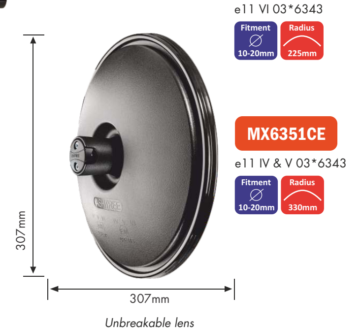
"B" versions of both mirrors are available with a clamp that fits 16-28mm diameter mirror arms