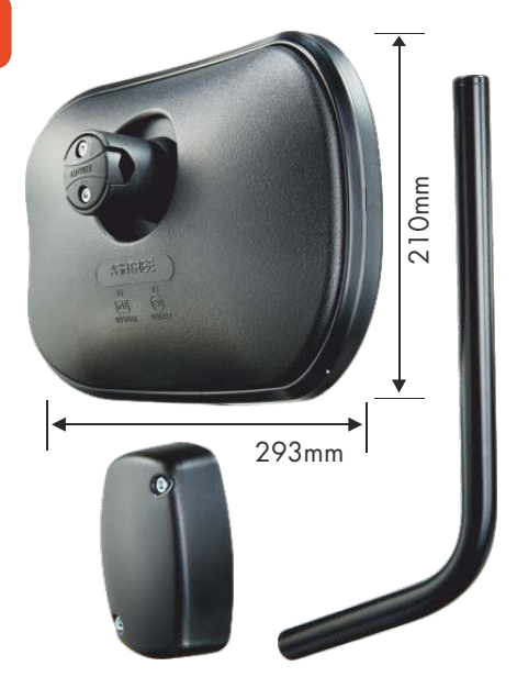
Unbreakable lens. Universal class VI mirror kit complete with arm and mounting bracket suitable for vertical or horizontal fitment.