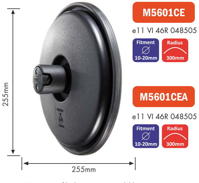
"B" versions of both mirrors are available with a clamp that fits 16-28mm diameter mirror arms

The MX550CEA comes complete with the $1091 arm. This is 440mm long and is 19mm in diameter. The clamp will fit arms of 16-28mm. This arm is available as a separate component.