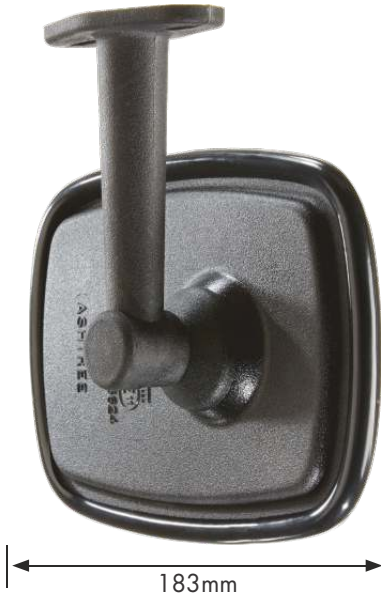
Mounting bracket has two M6 slots that fasten at 40-60mm centres